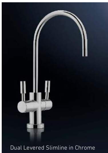
Dual Levered Slimline in Chrome

Instant chilled & sparkling filtered water