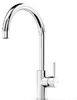
Gooseneck Mixer in Chrome

* To order a square mixer change Product code on page 2 from LP to LG