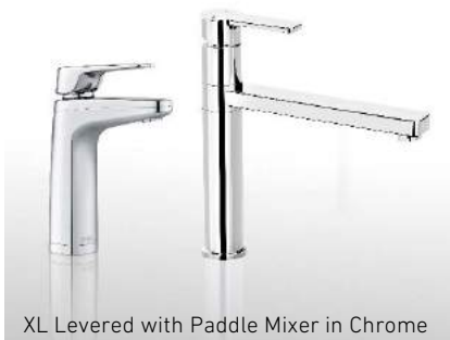
XL Levered with Paddle Mixer in Chrome

Billi Quadra Plus units are available with a choice of XL Levered, XT Touch & XR Remote dispenser styles and Paddle, Gooseneck or Square Mixer taps in a range of finish options including Chrome, Matte Black, Matte White & Rose Gold.