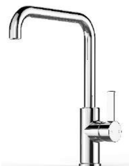
Square Mixer in Chrome

* To order a square mixer change Product code on page 2 from LP to LG