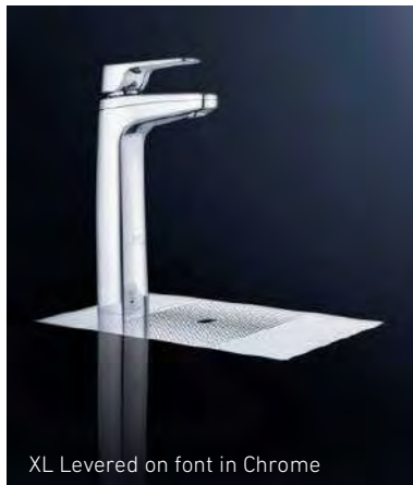
XL Levered on font in Chrome

Instant boiling, chilled & sparkling filtered water